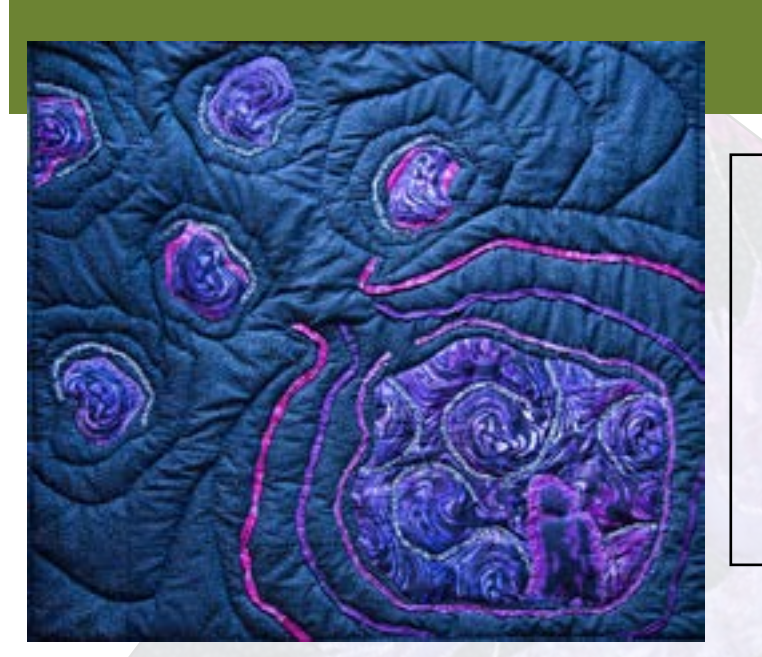
Icon 10: The Womb of God

What is an experience of this safe, warm, sacred, loving space in your life?