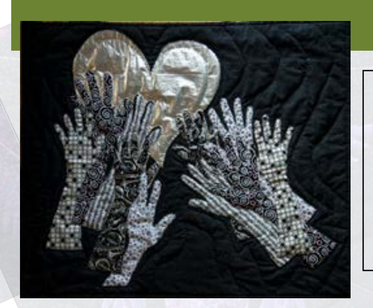
Icon 13: Hands of Reconciliation

What kind of reconciliation is arising for consideration in your life?